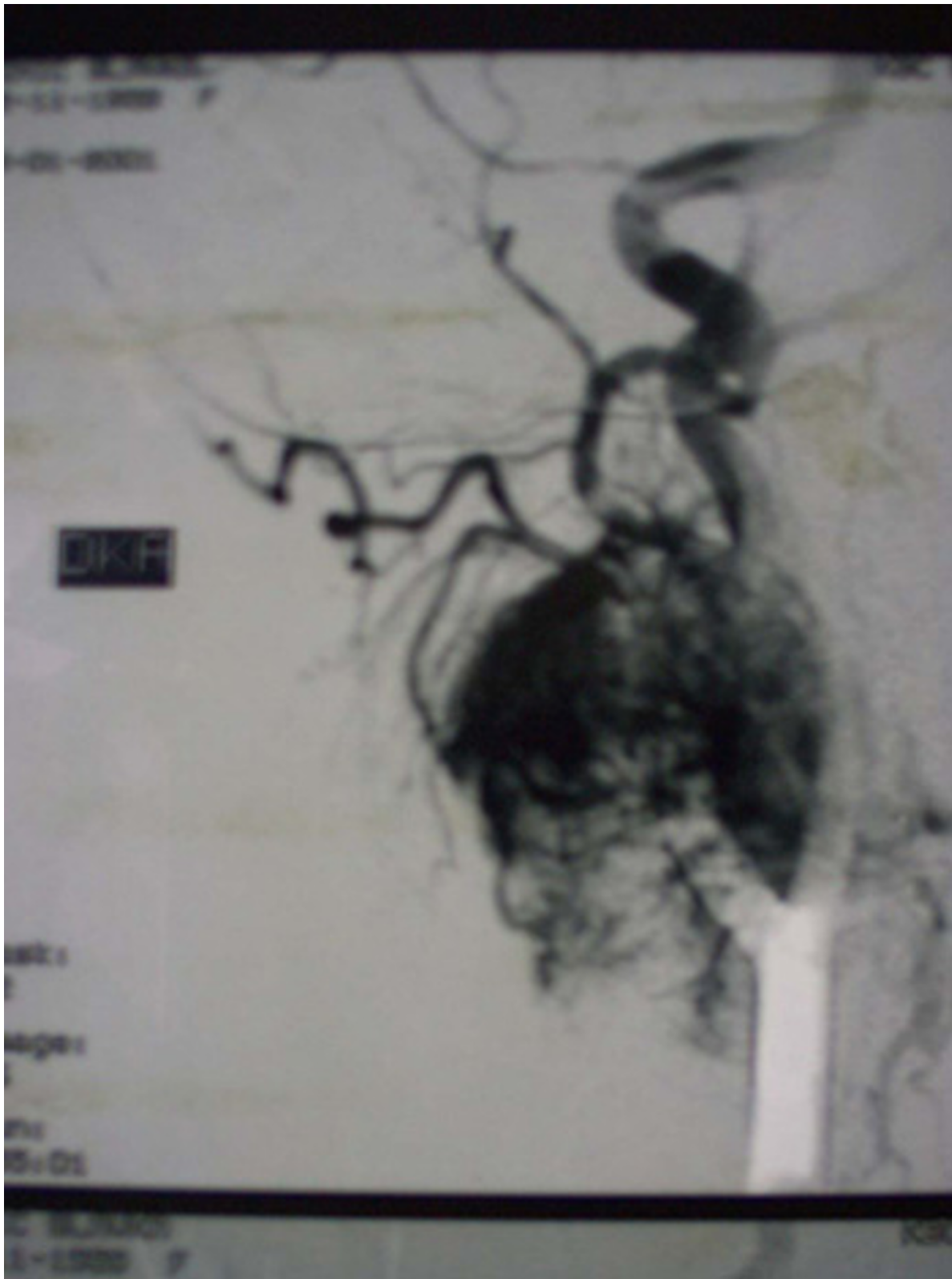
Figure 2 Selective carotid angiography showed hypervascularization of the carotid body paraganglioma mostly from the external carotid artery.