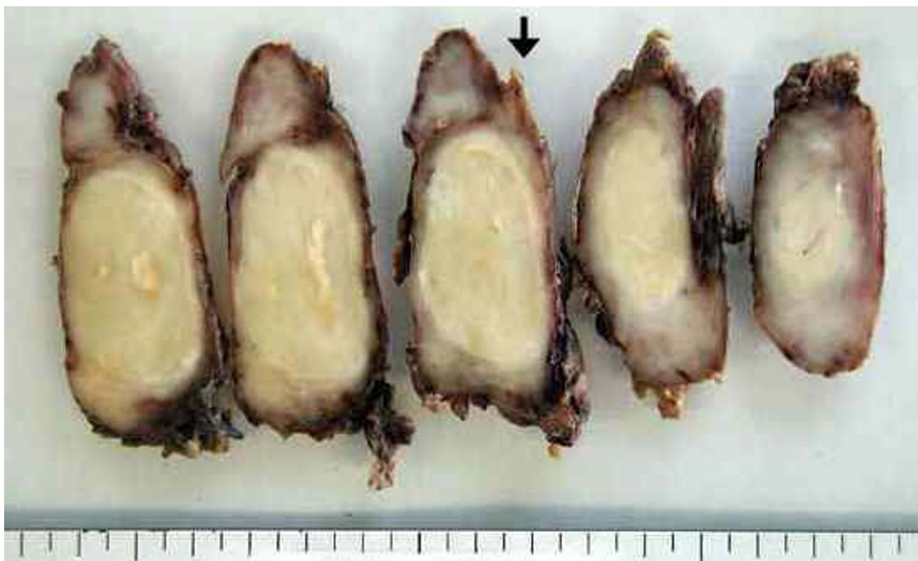
Figure 3 Macroscopic findings of the tumor. The tumor showing the continuity of the vagus nerve (arrow head) was whitish in color and oval shaped while measuring 5 × 3 cm in diameter.