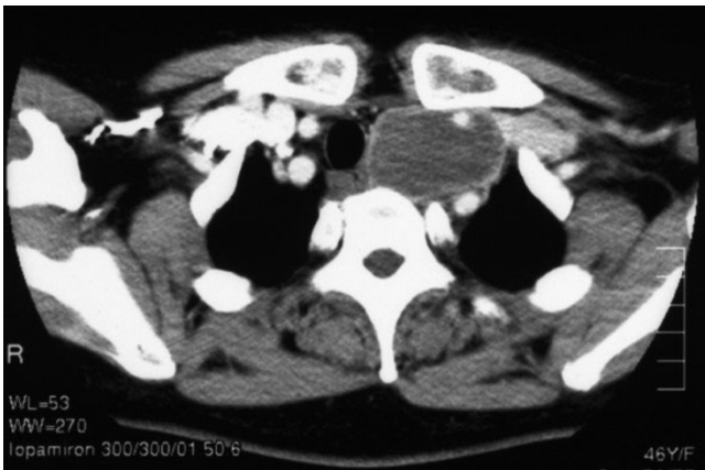
Figure 2 Chest CT showed a mass, measuring 5.0 cm in size in the upper mediastinum.

esophagus and it seemed to involve the left common carotid artery (Figure 2). Based on these findings, and cytology findings a clinical diagnosis of stage IIIB (T4N3M0) non-small cell lung cancer (NSCLC) originating from the apex of the left lung involving both the mediastinum and the supraclavicular lymph nodes was made [2]. The patient received concurrent chemo-radiotherapy (cisplatin 80 mg/m 2 for days 8 and 36 + UFT 400 mg/m 2 , both on days 1–14 and on days 29–42 plus radiotherapy,