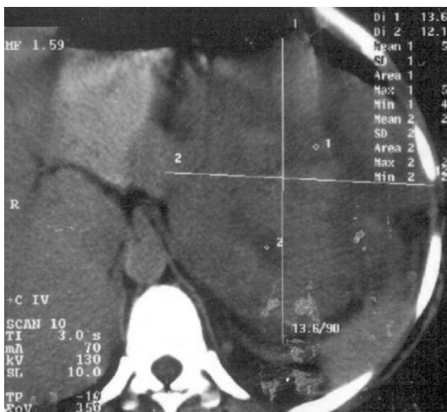
Figure 2 contrast enhanced CT abdomen of the patient showing the same lesion as in fig. 1 which is non enhancing.

calcifications (figure 1 & 2). The mass was contiguously involving the upper half of the kidney. Fine needle aspiration cytology (FNAC) of the mass was suggestive of sarco-