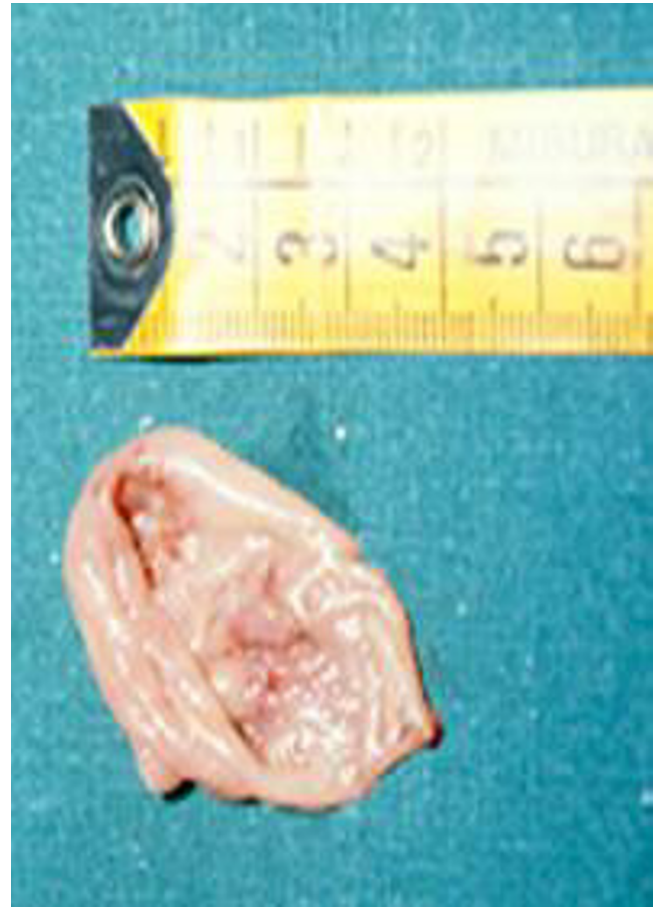
Figure 2 Postoperative diverticulum specimen.

ing to the left with barium passing into the cervical and thoracic esophagus without spilling of into the tracheo-bronchial tree (Figure 1). The patient admitted to having occasional episodes of dysphagia, regurgitation, and sialorrhea in the past 2 months. Further work-up of his diverticulum included an endoscopy that confirmed the diverticulum without irregularity of the mucosa in the esophageal inlet but with diffuse edema of the entire hypopharyngeal mucosa. He underwent left transcervical one-stage pharyngoesophageal diverticulectomy with removal of the sac using a stapling device (TA-30) and myotomy. Pathological examination revealed a 6 \times 5 \times 1.5 cm sac with normal external appearance (Figure 2). The sac contained an epithelial lining with stratified squamous epithelium. The submucosa showed fibrous tissue surrounding it with non-specific chronic mucosal inflammation noted in the wall of the diverticulum. Nearer the neck of the sac, scanty muscle fibers were found. An ulcerated tumor (grade 2, squamous cell carcinoma) measuring < 1 cm in diameter was identified at the fundus of the diverticular sac. The lesion had micro invasion of the submucosa and the muscularis mucosa (pT2) (Figure 3). Marked epithelia dysplasia was noted surrounding the lesion (Figure 4). Intense peri-tumoral lymphocyte reaction was present (Figure 3, 4). The mucosa at the site of excision was free of involvement (R0). Because of the