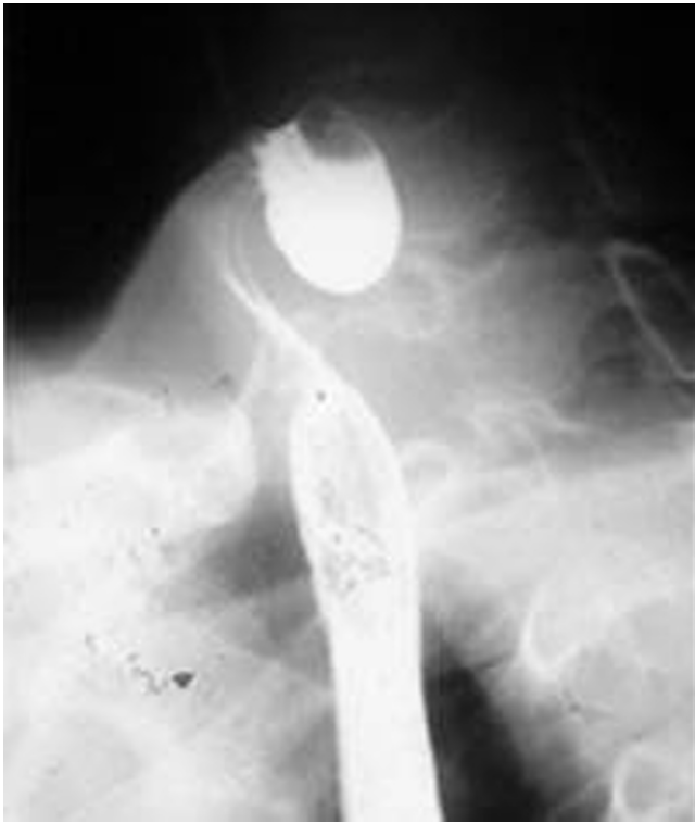
Figure 1 Radiological stage III diverticulum.

ing to the left with barium passing into the cervical and thoracic esophagus without spilling of into the tracheo-bronchial tree (Figure 1). The patient admitted to having occasional episodes of dysphagia, regurgitation, and sialorrhea in the past 2 months. Further work-up of his diverticulum included an endoscopy that confirmed the diverticulum without irregularity of the mucosa in the esophageal inlet but with diffuse edema of the entire hypopharyngeal mucosa. He underwent left transcervical one-stage pharyngoesophageal diverticulectomy with removal of the sac using a stapling device (TA-30) and myotomy. Pathological examination revealed a 6 \times 5 \times 1.5 cm sac with normal external appearance (Figure 2). The sac contained an epithelial lining with stratified squamous epithelium. The submucosa showed fibrous tissue surrounding it with non-specific chronic mucosal inflammation noted in the wall of the diverticulum. Nearer the neck of the sac, scanty muscle fibers were found. An ulcerated tumor (grade 2, squamous cell carcinoma) measuring < 1 cm in diameter was identified at the fundus of the diverticular sac. The lesion had micro invasion of the submucosa and the muscularis mucosa (pT2) (Figure 3). Marked epithelia dysplasia was noted surrounding the lesion (Figure 4). Intense peri-tumoral lymphocyte reaction was present (Figure 3, 4). The mucosa at the site of excision was free of involvement (R0). Because of the