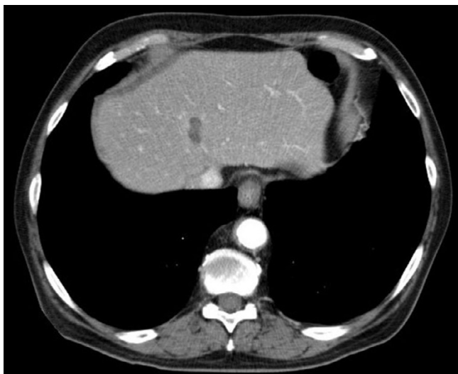
Figure 2 Region of thermoablation, liver segment 8.