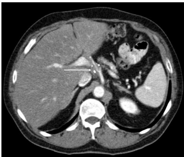
Figure 3 A stable disease of the gastric carcinoma surrounding the hepatic artery (arrow) could be detected after the 36 cycles chemotherapy (clips).

The antineoplastic agent taurolidine was intravenously applied in a 2% solution (Geistlich Pharma AG Wohlhusen, Switzerland) using a port catheter system. The monthly therapy (300 mg/kg/day according 24,9 g taurolidine/day) was given for 5 days in four hours' therapy sessions and 2 hours' intervals. Tumor markers (carcinoembryonal antigen-CEA, CA 72-4) were determined at the beginning and at the end of the therapies. Blood counts