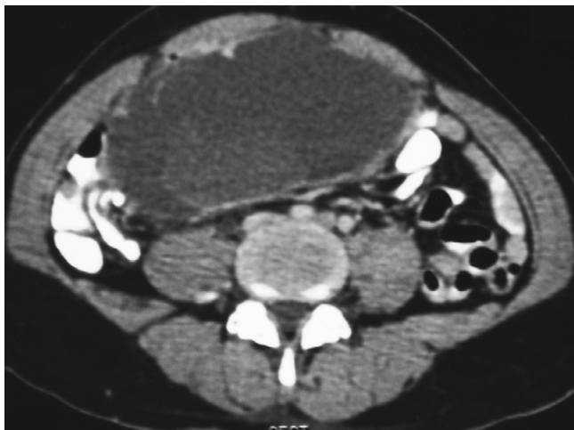
Figure 4 CECT of the abdomen done after three months of imatinib therapy showing a good response, evidenced by a cystic conversion of the mesenteric mass with no enhancing areas within.

GIST mostly metastasizes within the abdomen. In one series of 83 patients [7], the common sites of metastases were to the liver (46%) and peritoneum (41%). Other