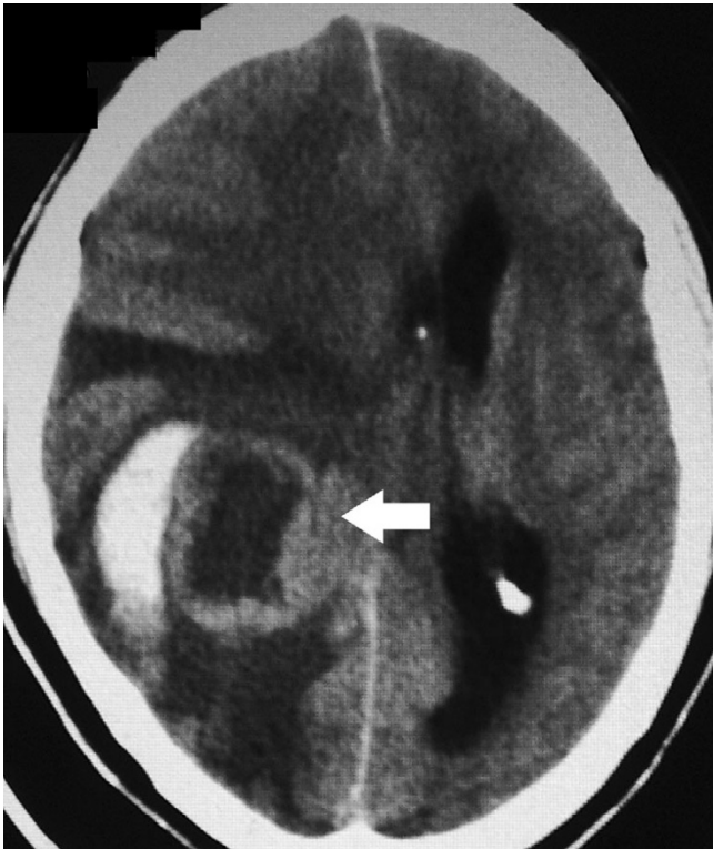
Figure 1 CT scan of the brain showing a 3.5 cm sized ring-enhancing mass (arrow) in the right parietal lobe with significant mass effect and compression of the right lateral ventricle. There is significant peri-lesional oedema.

The patient remained asymptomatic till June 2004 when he complained of abdominal fullness and pain. CT of the abdomen showed a large mesenteric mass measuring 8 × 6 cm in size. An ultrasound guided tru-cut biopsy from the mesenteric mass revealed a malignant spindle cell tumour with morphology similar to that of the brain tumour. The mitotic index of the abdominal tumour was 10 per 50 HPF (high power fields). Immunohistochemistry was positive for CD34, vimentin; and negative for GFAP (glial fibrillary acidic protein) and SMA (smooth muscle actin). Thereafter the patient was treated with six cycles of combination chemotherapy with ifosfamide 1.8 gm/m 2 i.v. D1-4 with mesna uroprotection and epirubicin 60 mg/m 2 i.v. in two divided doses, as 3-weekly cycles until November 2004. However, there was no apparent clinical response