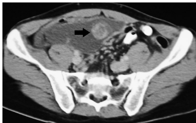
Figure 5 CECT of the abdomen done three months after that in Figure 4 showing a focal nodular area of enhancement (arrow) within the mesenteric mass, which is suggestive of disease progression. The patient died four months later.

sites of metastases reported in this series include the retroperitoneum, lung, bone and abdominal scar. Involvement of the central nervous system (CNS) by metastatic GIST is extremely rare. A review of the literature reveals only three reports of CNS involvement by GIST. In all cases, patients had known metastatic disease elsewhere prior to the development of CNS metastases. In one case [8], a 60-year-old male with diagnosed metastatic GIST developed sudden unilateral blindness that was found to be caused by metastatic involvement of the cavernous sinus. In the second case [9], a 47-year-old male who was being treated with imatinib for metastatic GIST developed multiple cerebral relapses even while systemic disease appeared to be controlled. In the third case [10], a 75-year-old male with multiple liver and peritoneal metastases developed a single intracranial lesion. In the third patient, all lesions including the intracranial lesion showed a good response to imatinib therapy.