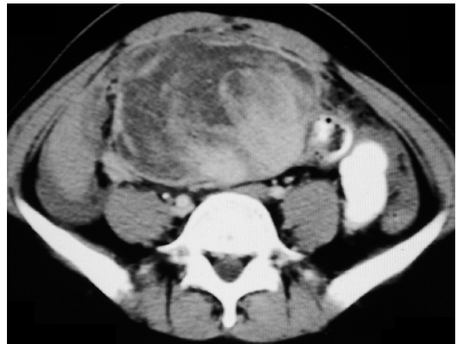
Figure 3 Contrast enhanced CT (CECT) scan of the abdomen done in November 2004 after 6 cycles of ifosfamide and epirubicin combination chemotherapy showing a 10 × 8 cm sized heterogeneously enhancing mesenteric mass.

Given the failed response to chemotherapy, the pathology specimen was retested for CD117/c-kit which turned out to be positive. Thus, the patient was diagnosed as a primary mesenteric gastrointestinal stromal tumour presenting as solitary brain metastasis. The patient was then treated with imatinib mesylate 600 mg oral daily. CT scan