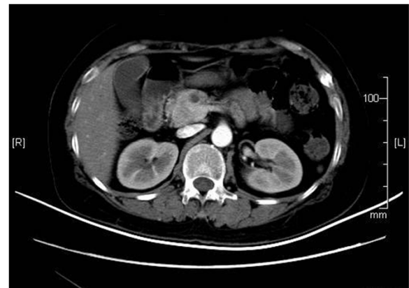
Figure 2 Contrast-enhanced computed tomography scan of the abdomen. A 3-cm nodular mass in the head of the pancreas was seen. There was no evidence of metastases.

levels of chromogranin A, a tumor marker for neuroendocrine tumors, were elevated (243 ng/mL, normal value <96 ng/mL), as were levels of glycosylated hemoglobin (6.3%, normal value <5.7%) and the patient was diagnosed with diabetes mellitus.